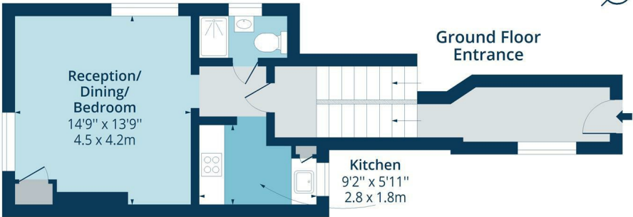
First Floor Floor Area 428 Sq Ft - 39.76 Sq M